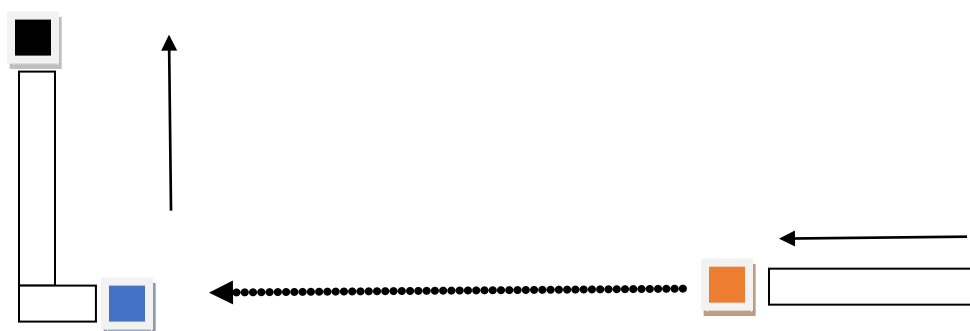
Figure 1. Existing handling method

In this example case study, product was processed and placed into boxes. Employees approximate the weight so the product is within \frac{1}{2} pound of the actual weight. An employee grabs the box and places it on a pallet (denoted by orange square in Figure 1). Once a pallet load of product is completed, a powered pallet jack moves the pallet to a packing station and the boxes are placed on another conveyor (denoted by blue square below). Each box is lifted from the pallet, rolled to a scale, weighed, then closed for packing. Once the final weight is established, a bar code is applied to the box, each box is moved to a pallet, and another pallet jack moves the pallet to a freezer. The black square below denotes the completed pallet of product that is ready for storage.