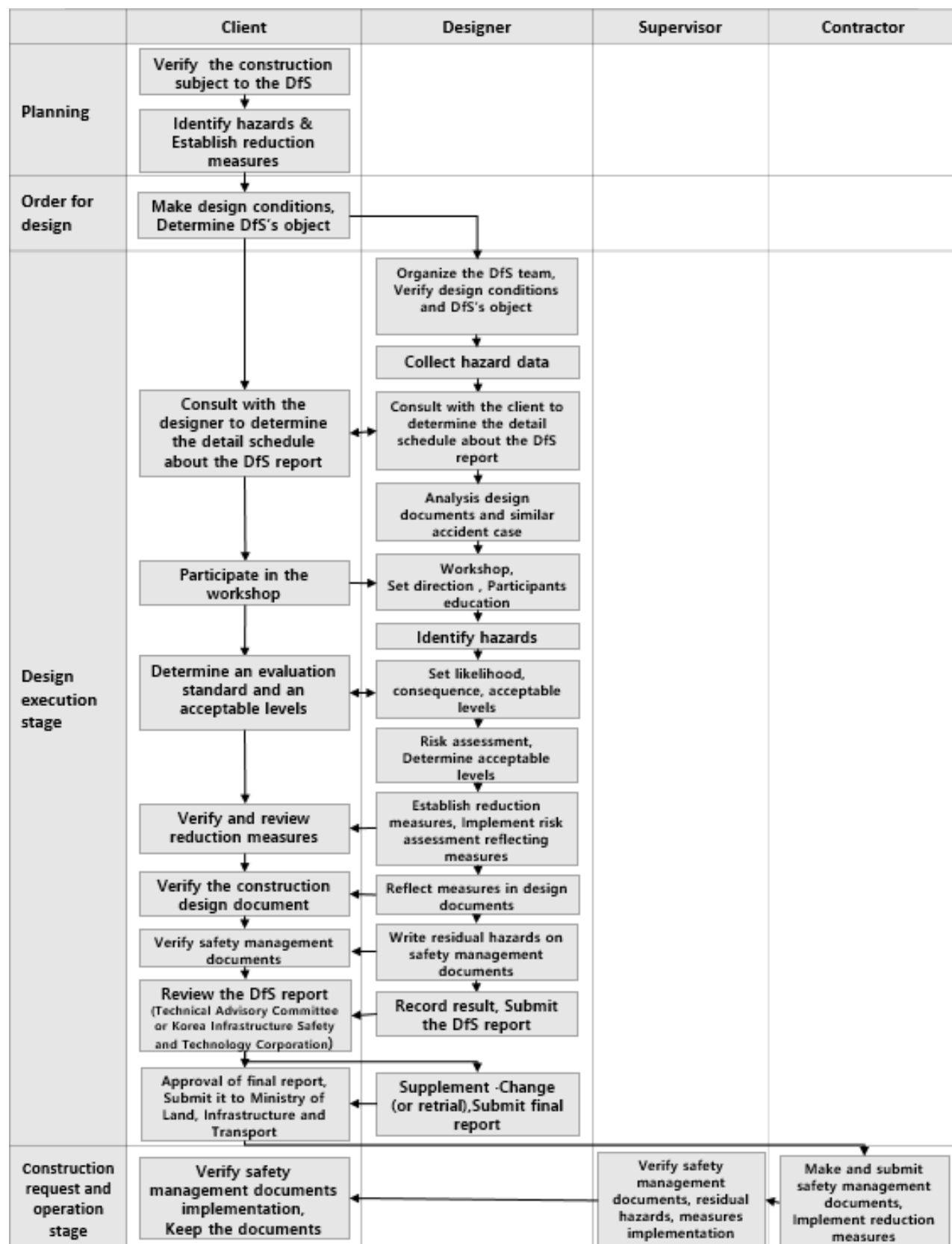
Figure 2. Proposed Construction Participants' Roles at Plan, Design and Construction Stage