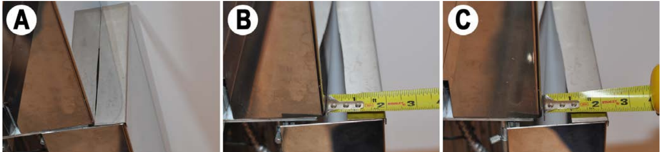
Figure 5. Automatic Sliding Door Sensor Header Testing.

automatic sliding door opened when the female surrogate was 66 inches from the door face with the door header open 11/16 inch. The automatic sliding door opened when the female surrogate was 70 inches from the door face with the door header open 15/16 inch.