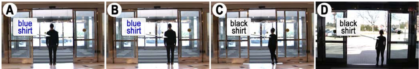
Figure 4. Automatic Sliding Door Safety Check (Surrogates Standing Motionless in Door Threshold).