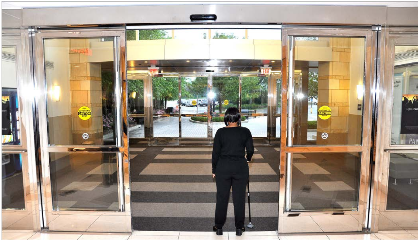
Figure 1. Automatic Sliding Door (Female Surrogate Holding Cane Standing in Door Threshold).