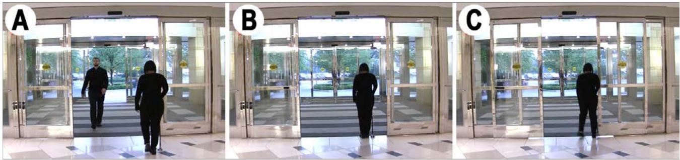
Figure 2. Accident Reconstruction (Female Surrogate at Right Threshold Contacted by Closing Door).