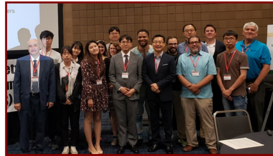
Students Presenter and ISOES EC Members