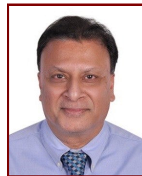
President Elect Clarence C. Rodrigues PhD, PE, CSP, CPE

potential to undermine human performance and operational excellence. Poor safety culture usually results in poor safety performance. Safety culture measures are leading indicators of safety performance and provide an insight to the state of safety in an organization. Perception surveys are a commonly-used technique for assessing safety culture. Perception surveys can measure effectiveness of safety systems as described by individuals within an organization, reveal strengths and weaknesses in current systems, and can identify what needs to be done to correct identified deficiencies. Oil and Gas and Aviation are 2 major sectors that are rapidly expanding the use of safety culture assessments.