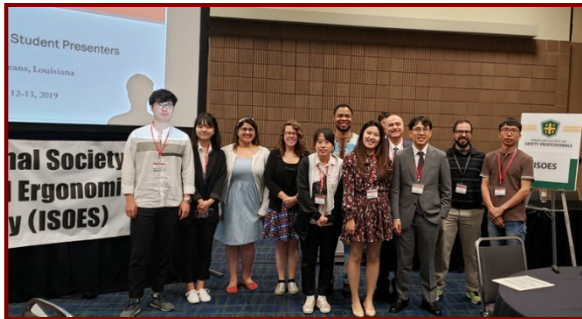
Students Presenters (ISOES-NOLA, 2019)