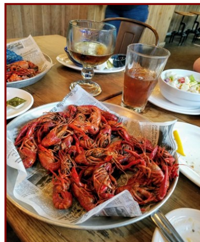
New Orleans' Bourbon Street – “beads in the trees” and “crawdads on a plate”