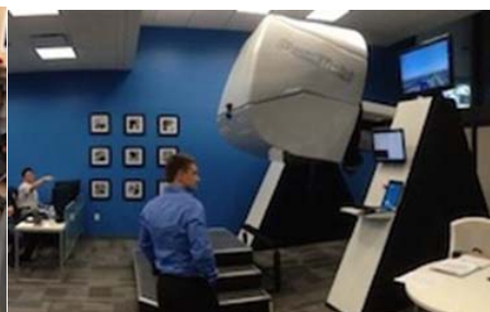
Multimedia motion simulator