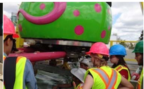
Experiential learning in the field