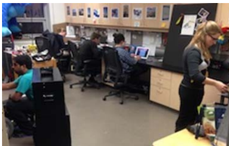
THRILL Lab workspace

For information about the THRILL Lab including contact information, visit www.ryerson.ca/thrill and visit the blog at thrilllab.blog.ryerson.ca