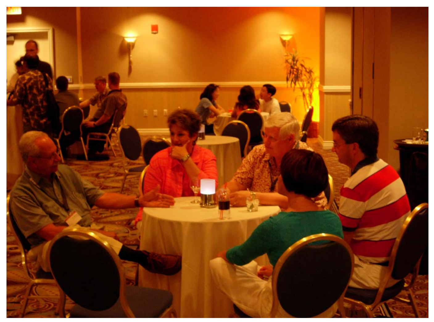
ISOES Attendees at the 2005 Conference in Las Vegas.