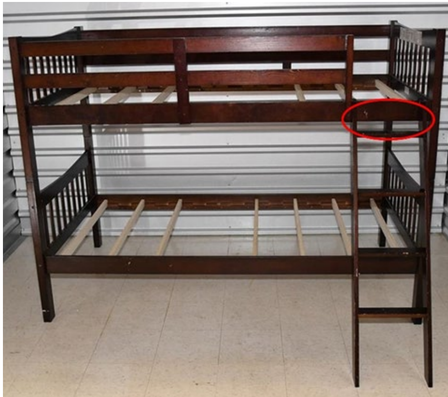
Figure 1. Incident Bunk Bed (Child Entrapment Gap Indicated by Red Oval)