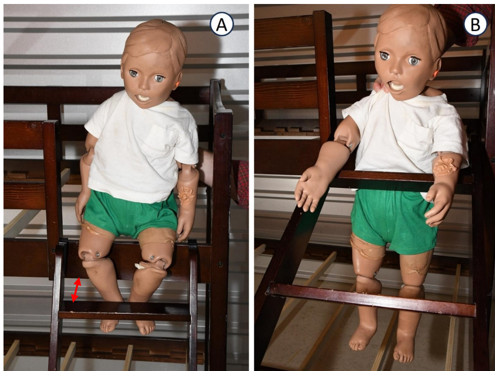
Figure 3. Anthropomorphic Child Dummy Trapped in Gap Between Ladder Top Rung and Upper Bunk Structure

mother tried to pull her two-year-old child through the space between the upper bunk structure and the ladder top rung to free his trapped body. The child's body was tightly wedged and would not move. During the child's extraction from the bunk bed, the child's mother pulled on the child's body, the ladder moved and one of the ladder top metal brackets broke, and eventually the child's body released from the entrapment.