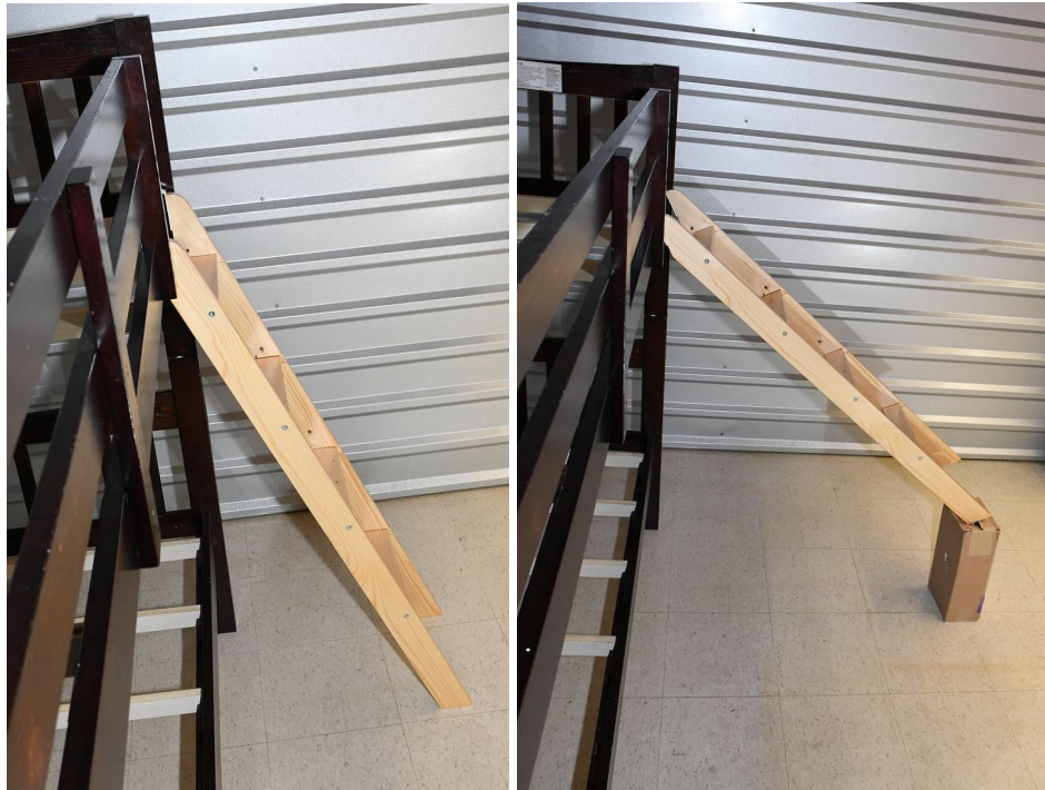
Figure 4. Exemplar Ladder Contacting Floor (Left Image) and Tilted (Right Image)