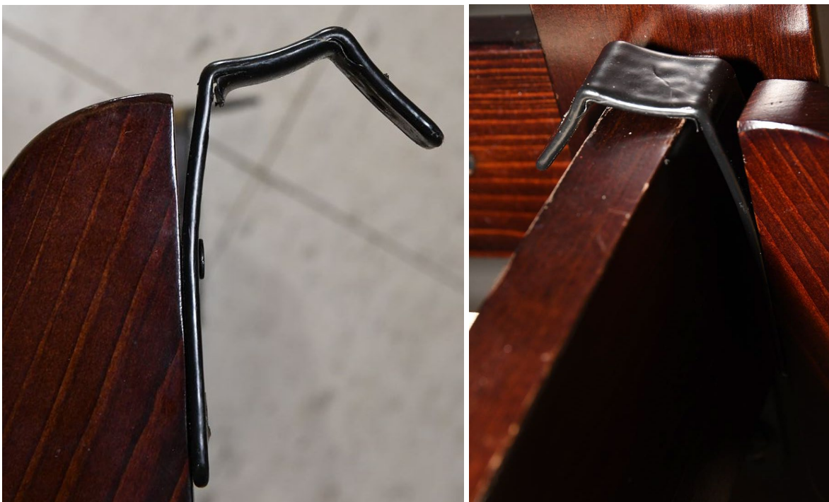
Figure 2. Deformed Bunk Bed Ladder Bracket After Incident