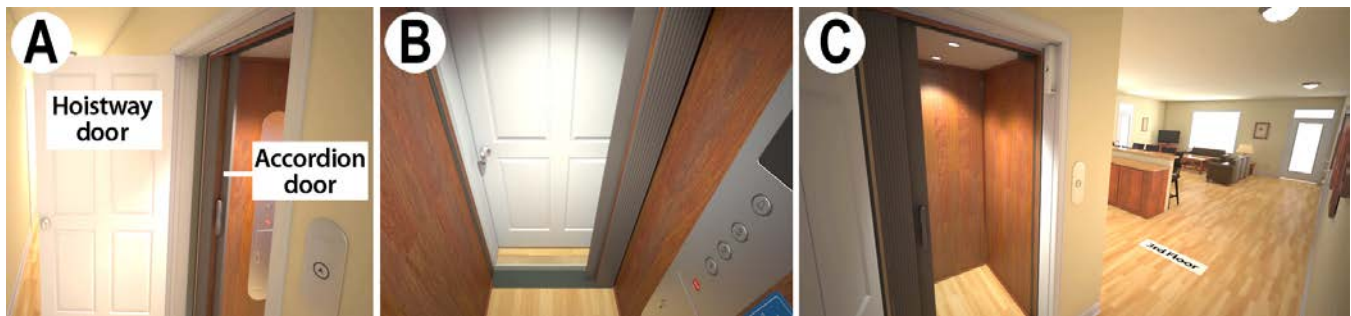
Figure 1. Beach Rental Vacation Home Elevator.