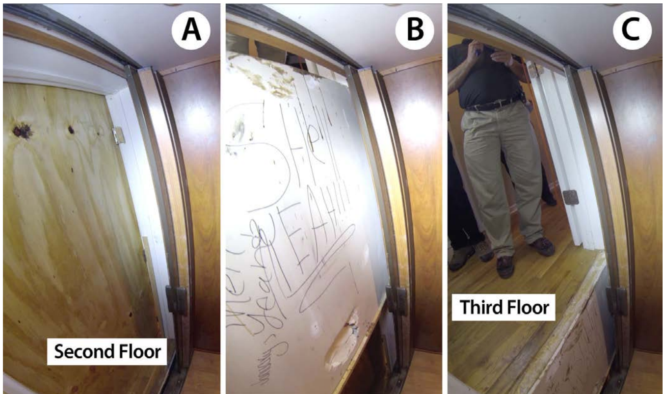
Figure 3. Elevator Video Sequence with Open Accordion Door (Car Moving Up from Second Floor to Third Floor).