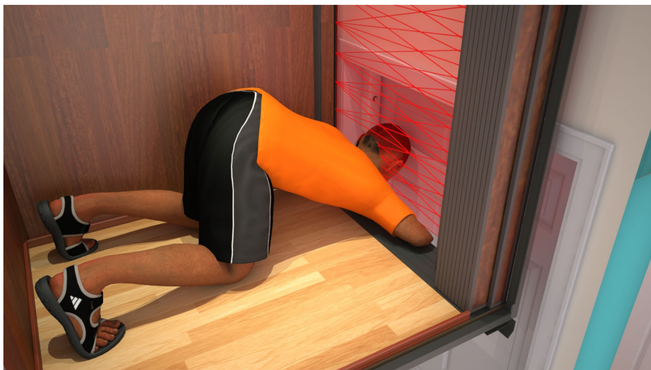
Figure 4. Elevator Light Curtain Accident Prevention.