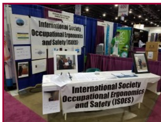
ISOES booth at ASSP Safety 2017 Expo, Denver, CO

Special Benefit for Expo Booth Volunteers - the Exhibitor Badge also provides access to the ASSP presentations on Monday and Tuesday, June 10-11, 2019. See photos of ISOES' Exhibitor booths at previous ASSP's PDCs i.e. Safety 2017 in Denver and Safety 2016 in Atlanta .