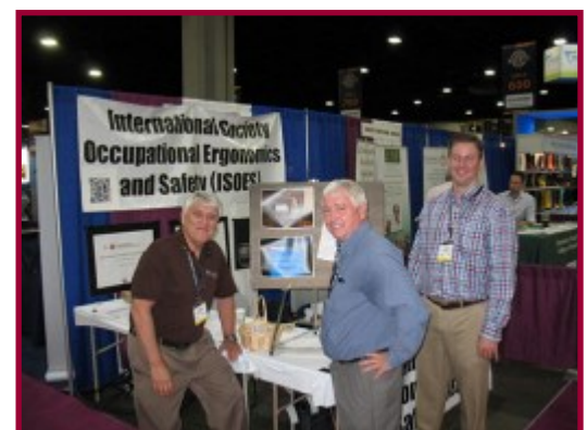
ISOES booth at ASSP Safety 2016 Expo, Atlanta, GA