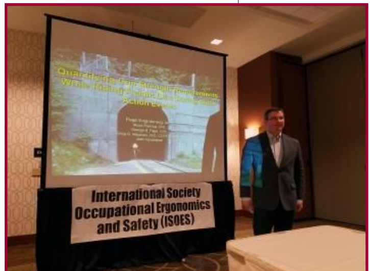
Page Engineering's international practitioners present findings on emerging E&S issues

"...please make your contribution to the success of next year's conference by emailing our Conference Information/Call for Abstracts to your ES&H Professional contacts."