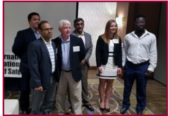
Current, past and future WVU team contribute to 2018 Pittsburgh Conference success!