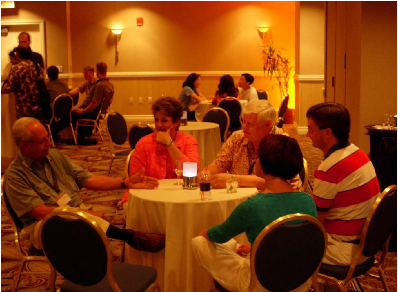
ISOES Attendees at the 2005 Conference in Las Vegas.